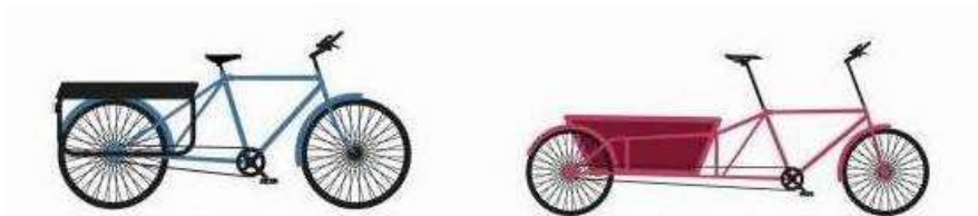
Long Tail type cargo bikes.

Long Tail – More modest in terms of capacity than Long John or Trike type bikes. Suitable for carrying both cargo and children.