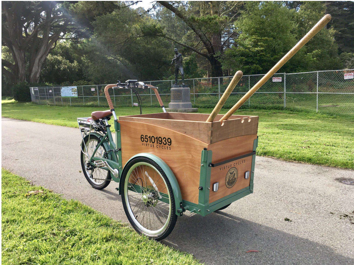
The cargo bike is helpful for performing landscaping work. Golden Gate Park, California, United States.

In connection with business activities, the demand for cargo bikes has also increased. Sales of cargo bikes in Europe have increased, according to a study conducted during the CityChangerCargoBike project. The results of the study are based on anonymous sales data from 38 manufacturers of cargo bikes. The results of the survey show a 60% increase in sales of cargo bikes in 2019 and, despite the coronavirus crisis, continued growth was expected in 2020. In 2018, the participants sold 17,800 bikes and in 2019, 28,500 cargo bikes, and the expected sales number in 2020 was 43,600. The study will continue and new results will be presented in spring 2021 3 .