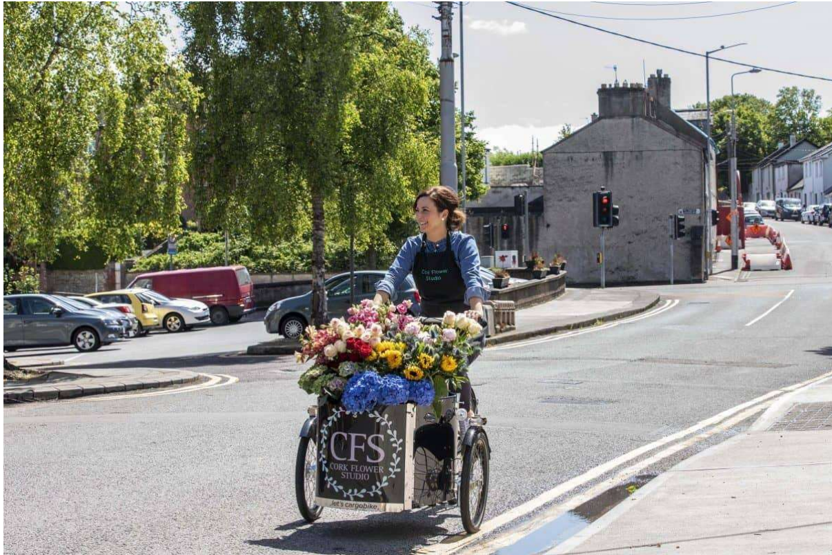
Flower Shop Cork Flower Studio. Cork, Ireland.

providers, stylists, coaches, and teachers. The use of a cargo bike has a positive impact on the company's reputation and the general physical and mental health of its employees.