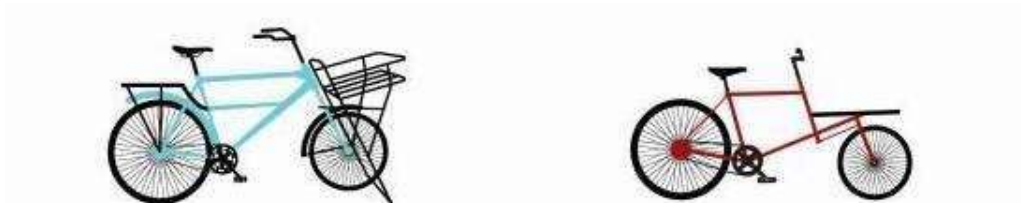
Hybrid bikes.