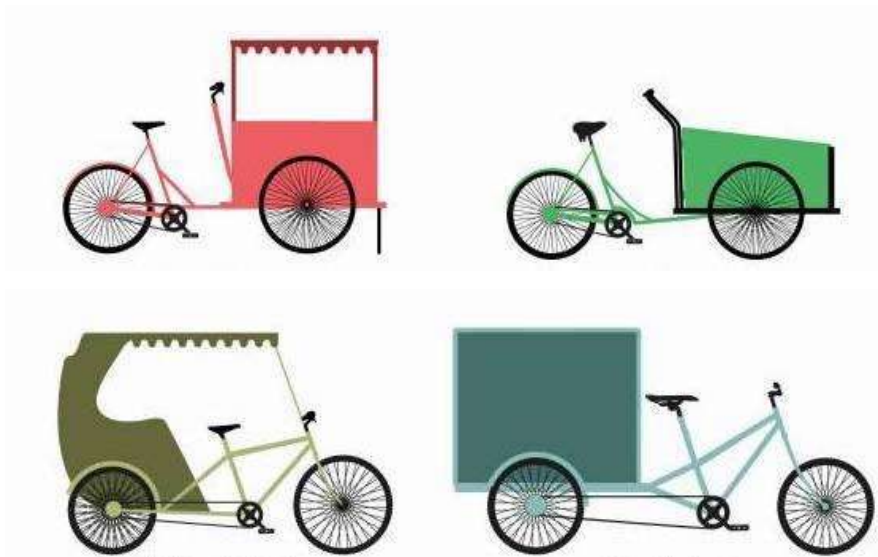
Trike type cargo bikes. Illustrator Karen Rike Greiderer.

Trike – a tricycle cargo bike that holds more and carries heavier weights than a Long John or Long Tail type cargo bike. The box is located in front of or behind the handlebars. Tricycles with a box in front of the handlebars are used for transporting people and cargo, as well as for business activities, such as running an outdoor café. Trike bikes with a rear box are used to transport heavy loads, they are widely used in the postal service, and a bicycle taxi also belongs to this category.