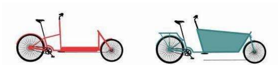
Long John type cargo bikes.

Long John – two-wheeled cargo bike. The box for carrying cargo or people is located in front of the handlebars. Used to transport both people and cargo. In terms of capacity, it ranks second behind the Trike type bike.