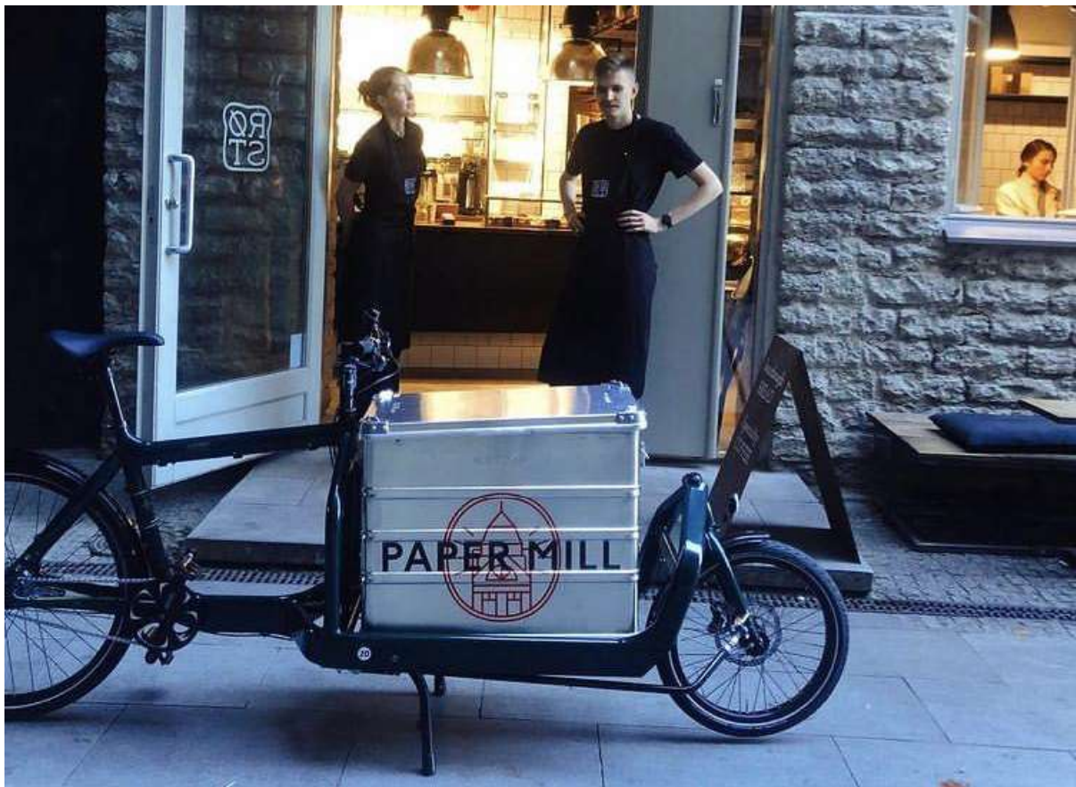
Paper Mill is a coffee roastery in Tallinn. In the photo, the coffee beans are transported to the customer on a Long John type cargo bike.