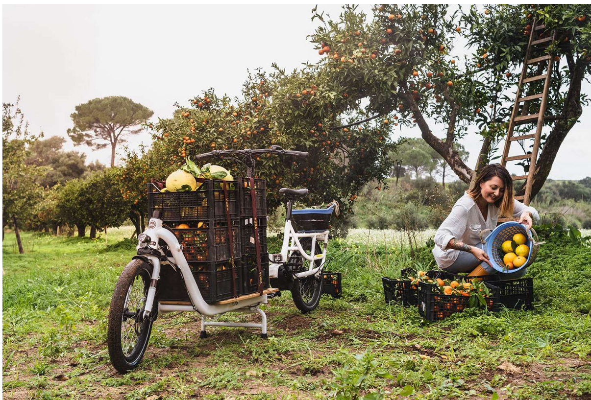
Long John type cargo bike as a tool in an orchard.